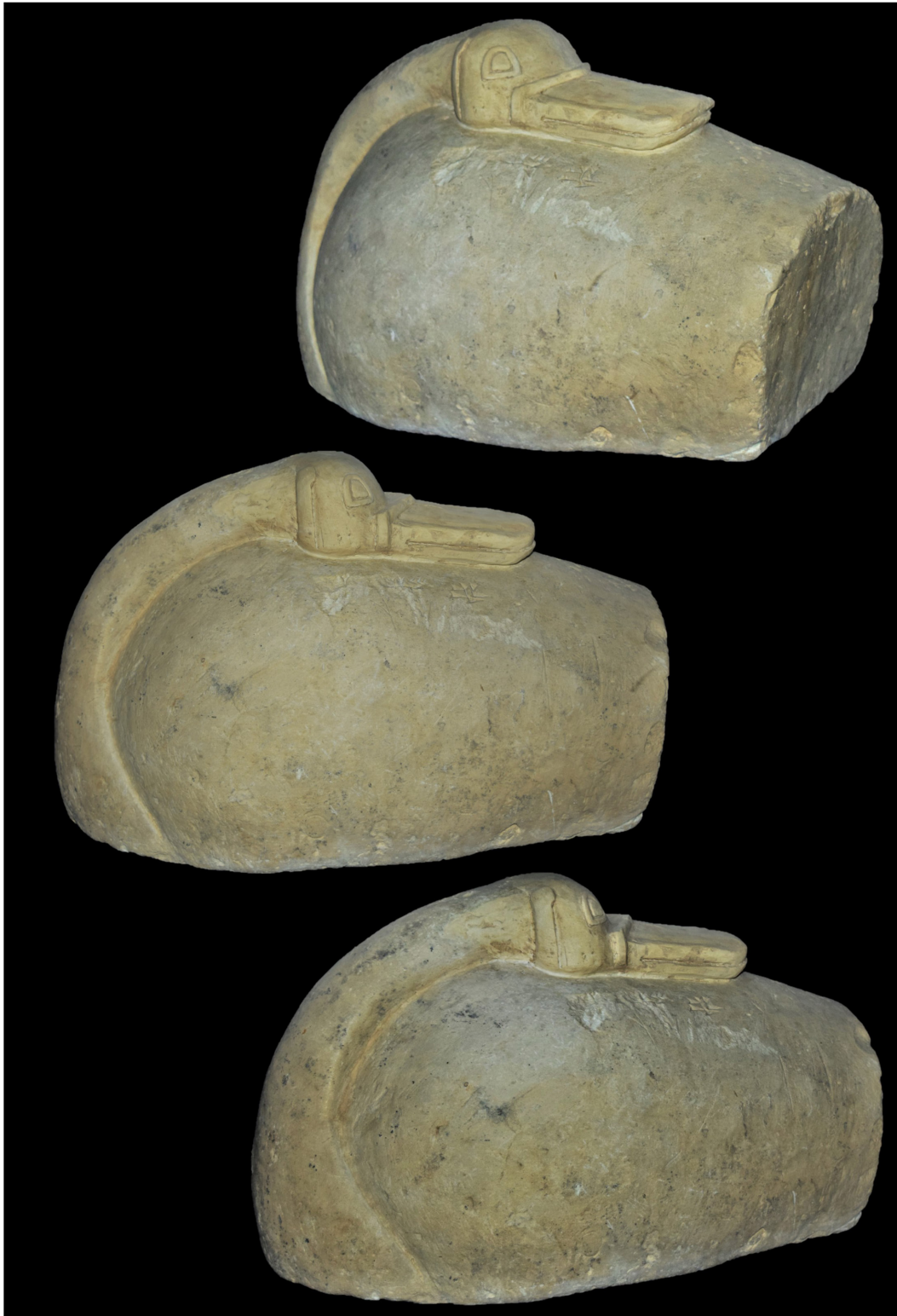
Fig. 2. Arjan duck-shaped weight, Susa Museum. Photographs of the partly reconstructed right side by J. Álvarez-Mon (Susa Museum, October 2017).