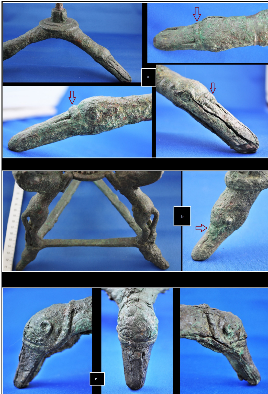
Fig. 4. Jubaji candelabra.