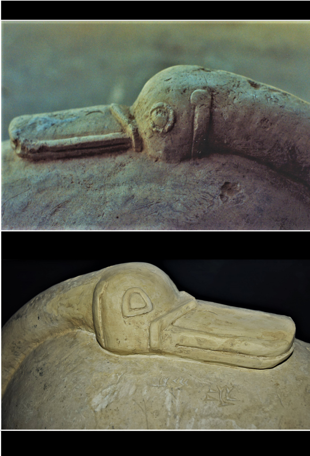
Fig. 3. Details of the head of the Arjan duck-shaped weight, Susa Museum.