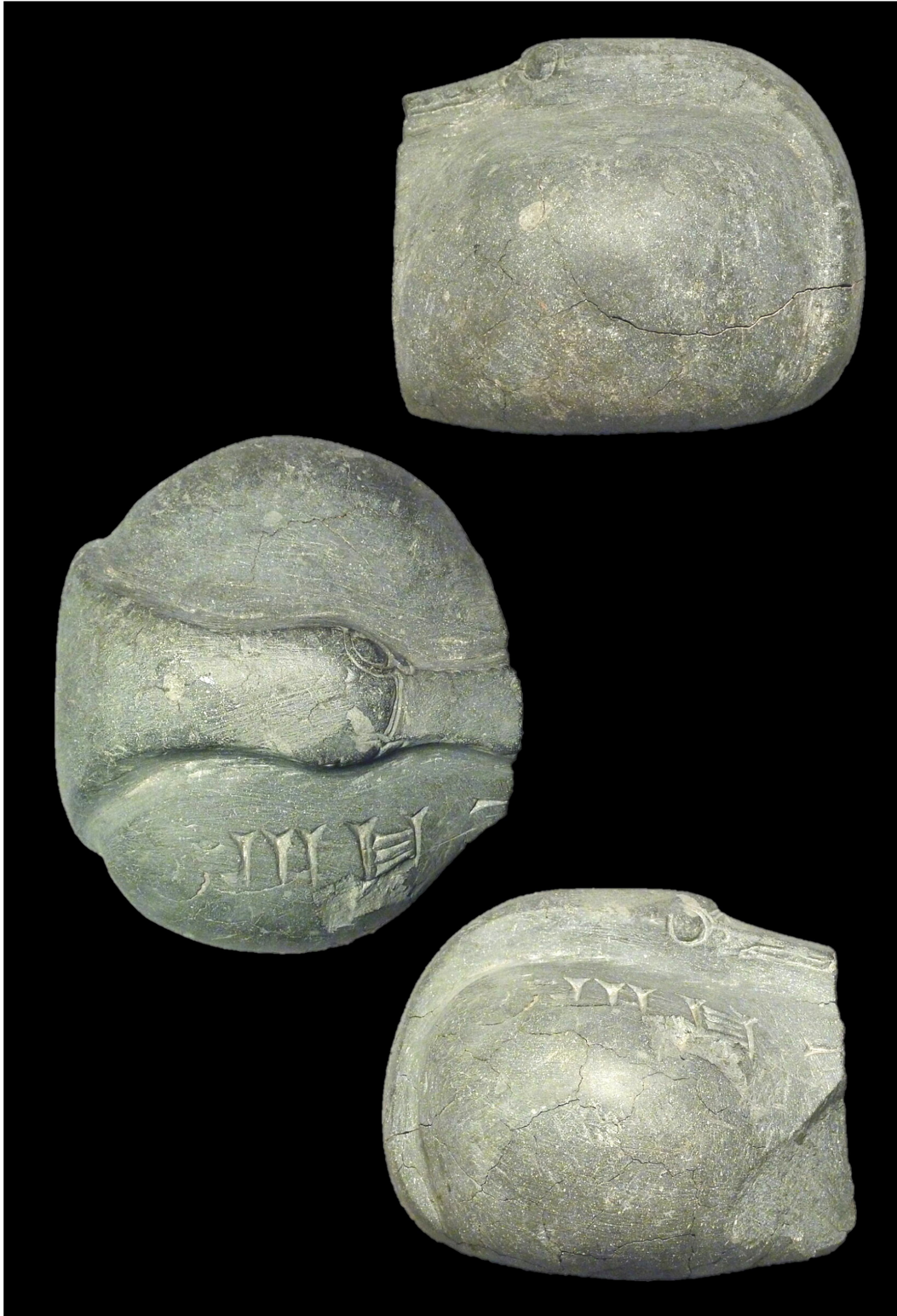
Fig. 6. Bituminous stone duck weight from Susa, Louvre Museum catalogue no. Sb 9346.