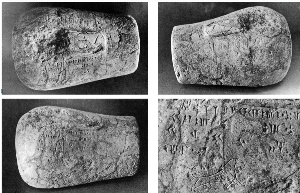
Fig. 7. Assyrian duck weight from Nimrud with an inscription of Tiglath-pileser III (744-727 BCE). After Hussein 2016, Pl. 94a.

The inscription on the duck weight and its stylistic elements unique to late Neo-Elamite artistic production argue for its manufacture around the late seventh/early sixth century BCE by a local Elamite administration post-dating the collapse of the Assyrian empire. It was natural enough that this administration, which also produced the inscribed 3 mina bituminous stone duck weight from Susa, had incorporated the Mesopotamian metrological systems used more broadly in the Near East. This follows on from earlier periods at Susa and at the Elamite highland capital of Anshan (Tal-i Malyan) where Elamite administrative texts written probably around the late second millennium BCE document metals in the common Mesopotamian units of talent, mina, and shekel (Stolper 1984b, pp. 9-10). Besides the use of these fairly widespread units, most of the weights recovered from early to mid-second millennium BCE contexts (often burials) at Susa when the city was under Elamite rule replicate Mesopotamian