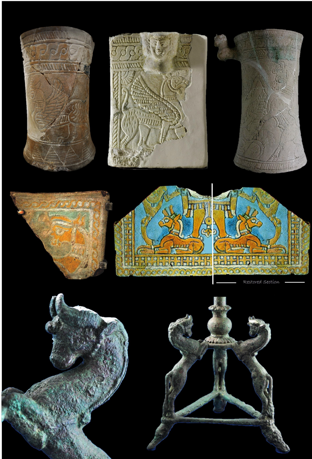
Fig. 5. Examples of Neo-Elamite animal iconography on faience and/or frit tiles and vessels from Susa and a bronze candelabrum from Jubaji.